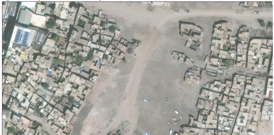
Produced by UNITAR – UNOSAT, Copyright: DigitalGlobe, Inc.

37. Diyarbakır's 2,000 year-old city walls surrounding the Sur district are a UNESCO-protected site of World Heritage. Municipal reports indicate that during the period of shelling of the Sur district, between September 2015 and May 2016, the Government took measures not to damage the city walls while systematically demolishing entire neighbourhoods within the area surrounded by the walls. This illustrates the systematic nature of destruction of private properties.