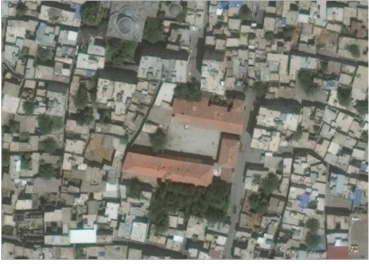
Image2: Suleyman Nazif School, Sur, Diyarbakir Province 5 March, 2016

Image 1: Suleyman Nazif School, Sur, Diyarbakir Province 22 June, 2015