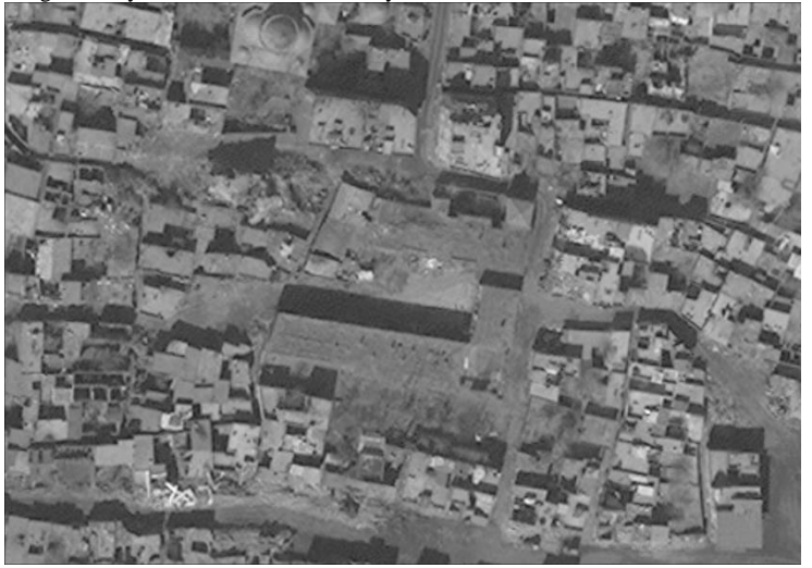
Image3: Suleyman Nazif School, Sur, Diyarbakir Province 26 July, 2016