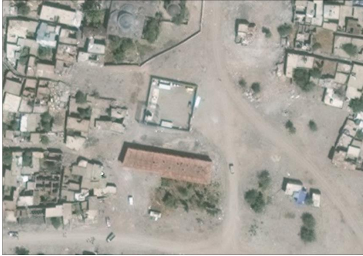
Produced by UNITAR – UNOSAT, Copyright: DigitalGlobe, Inc.