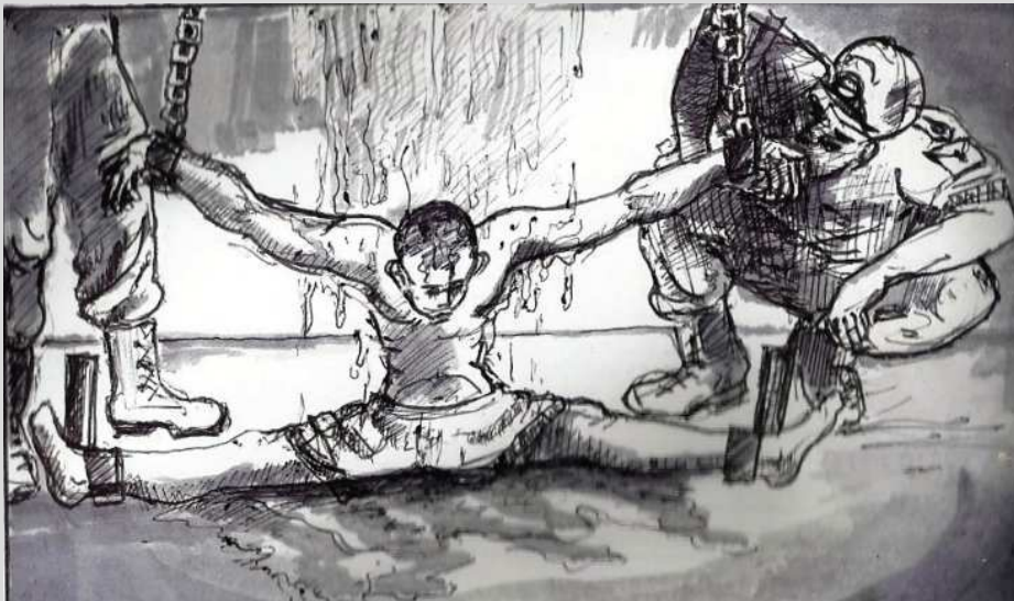
Figure 5 - An artist's drawing portraying 'water torture'. © Chijioko Ugwu Clement

Some former detainees have also described other forms of abuse that may violate the absolute prohibition of torture and other ill-treatment, including experiencing mock executions and being forced to watch other people being extrajudicially executed. As a result of increased scrutiny by human rights non-governmental groups, Nigerian human rights organizations have reported new methods of torture aimed at hiding visible marks on the body of victims. This include covering the ropes used in tying up suspects with cloth to avoid any mark on the body; and tying the upper arm of suspects with rubber to choke the flow of blood and covering detainees with plastic and placing them in the sun until they die.