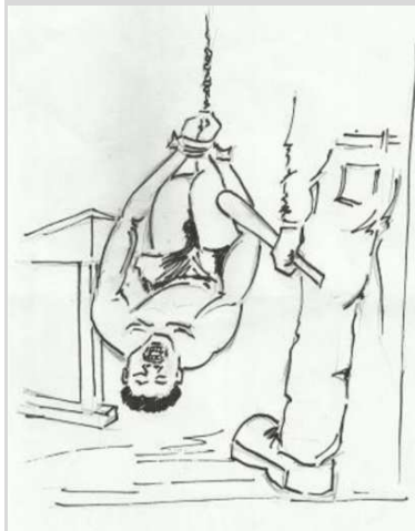
Figure 3 - An artist's drawing depicting a detainee being suspended upside down by their feet. © Chijioko Ugwu Clement