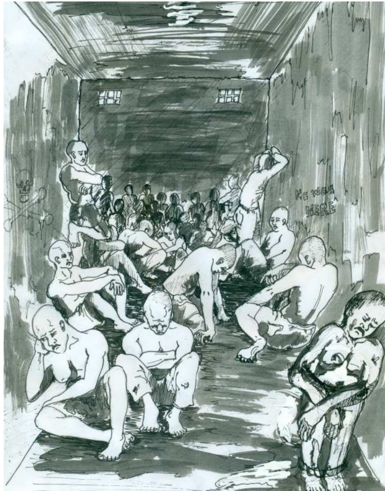
Figure 11 - An artist's drawing depicting Mustafa's account. © Chijioke Ugwu Clement

Conditions in detention facilities in Damaturu are also poor, and appear to amount to ill-treatment. Most of the detainees are kept at 'Sector Alpha' which consists of shops that were deserted and are now being used to detain people – there are no toilets or proper ventilation. Consistent accounts recorded by Amnesty International suggest that up to 50-70 people are put in cells that can only fit about five people. Conditions are marginally better at the Presidential Lodge (“guardroom”) also in Damaturu where detainees are kept in rooms that have been created by dividing a former squash court. About 15-20 people are kept in a room of 15 by 20 feet, but detainees are allowed to move around in the corridors during the day. There are also some toilets for common use at the end of the corridor.