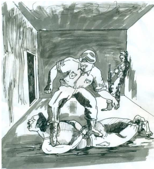
Figure 6 - An artist's drawing depicting Ahmed's account. © Chijioke Ugwu Clement

Many of my colleagues did not make it [died in detention]. The beating, the torture was just too much for us. They do all types of things to you, the soldiers. They will tie your hands behind your back, with the elbows touching and then one of them will walk on your tied hands with their boots. Your hands will remain tied and then they'll pour salt water on your wounds. You can't rub it, even if it goes into your eyes. My eyes got swollen as a result of that. I thought I was going to be blind. I have never experienced such brutality in my life." 23