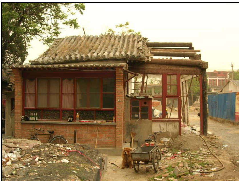
Dayuanfu hutong: traditional housing surviving in the rubble