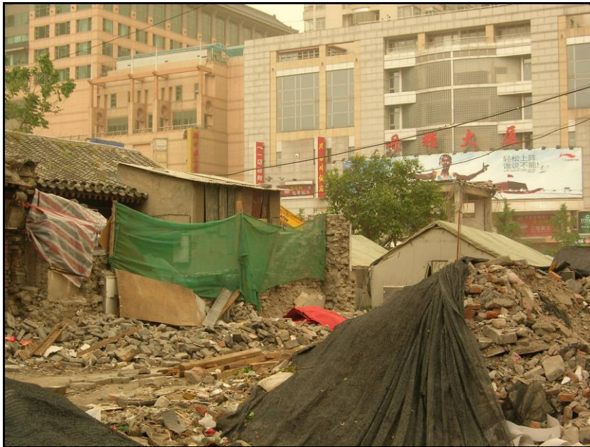
South of Dayuanfu hutong, demolitions near Wangfujing Street.

Regardless of this optimistic perspective, not everyone agrees on the definition of success. A man being interviewed about his eviction from Xianyukou stated: “Average Chinese citizens have no way to protect their rights.”