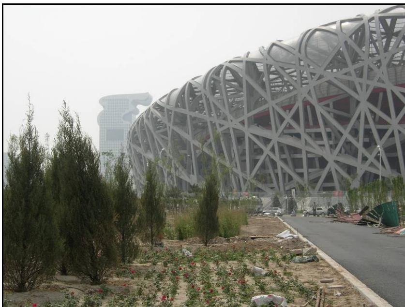
The Bird's Nest