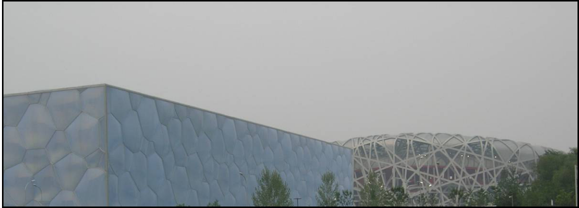
The Water Cube and the Bird's Nest at the Olympic Park

other and in which official Chinese figures report rampant corruption in land and housing confiscations by the Government.