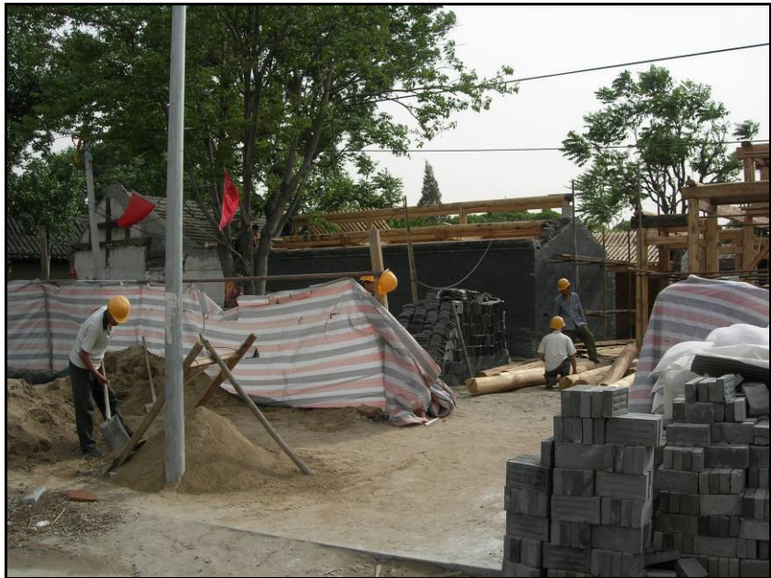
Demolition and reconstruction in Xianyukou

According to residents interviewed, the mediation talks for the first group of households to be evicted were held during the second half of 2005 and were finished by the end of the year. Many of these households were offered approximately 8 020 yuan per m 2 and many rejected this offer, as well.