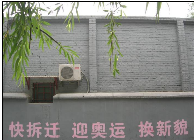
Dongchang hutong: text reads "Demolish quickly, Welcome the Olympics, Switch to a New Look."

In Dongchang hutong, for example, the authorities have painted slogans on the once plain, grey walls of the community, saying, "Welcome the Olympic Games", "Treasure the opportunity", "Improve our surroundings", and "Initiate a new life". The slogans encourage people to accept compensation offers and to leave early by invoking a spirit of cooperation to do what is best for the community rather than the individual, by moving out in order to "improve our surroundings". With the inclusion of the phrase "Welcome the Olympic Games" into this propaganda, authorities pressure residents to work together as a Beijing community to showcase their city and their country to the world, by putting the community's 'welfare' above their own individual rights. However, many residents do not believe that doing what is best for the community and the individual are mutually exclusive and have written their own graffiti on the walls of their homes, protesting unfair compensation rates.