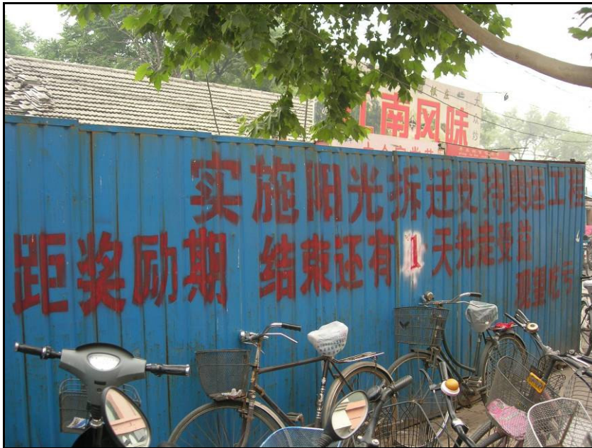
Dayuanfu hutong: text reads “Honestly implement sunshine demolition and support the Olympics Engineering. The reward date is approaching. There is still 1 day until [you can] leave early and receive benefits; wait around and lose out.”