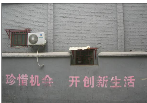
Dongchang hutong: "Treasure the opportunity, Initiate a new life."

There are also evictions scheduled for the Great China Gate East Factory Neighbourhood under a project for the cultural preservation of the area. A resident of the community explained that between one and two thousand people are expected to be affected by the demolitions and will have to move. As far as he understood, the authorities would be selective in what they tear down and will demolish non-history, and/or poorly constructed buildings, but will allow others to stay. They will reconstruct buildings based on the traditional courtyard style housing and will make these available to residents who can afford to pay more than the current owners and renters. Despite the painted slogans on their walls threatening residents to "Welcome the Olympics ... Leave early, receive benefits, wait around and lose out," residents were not aware of the exact date of the evictions, nor the rate at which they would be offered compensation.