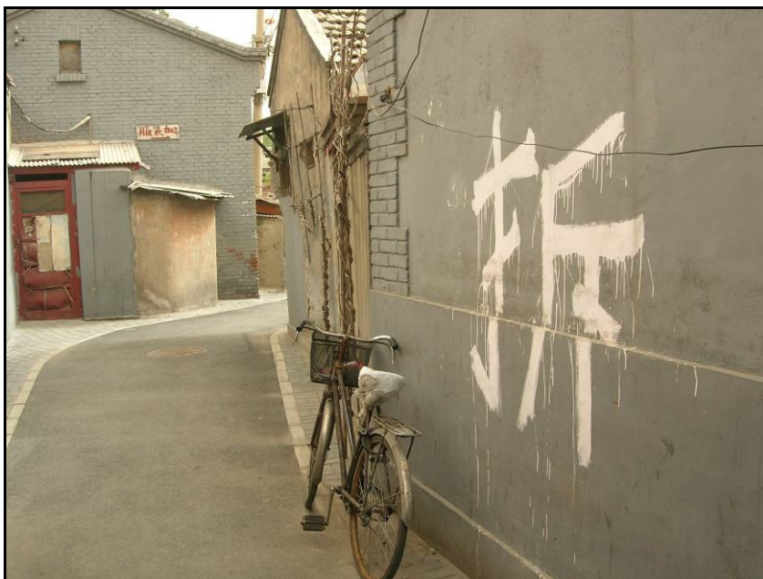
Dongchang hutong: text reads "demolish"