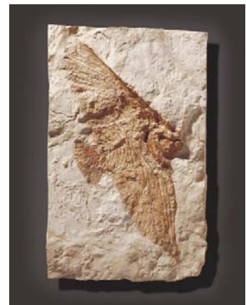
Fossil Angel Fish Estimate : €50.000-80.000