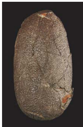
Dinosaur Oviraptor Estimate : €4.000-5.000