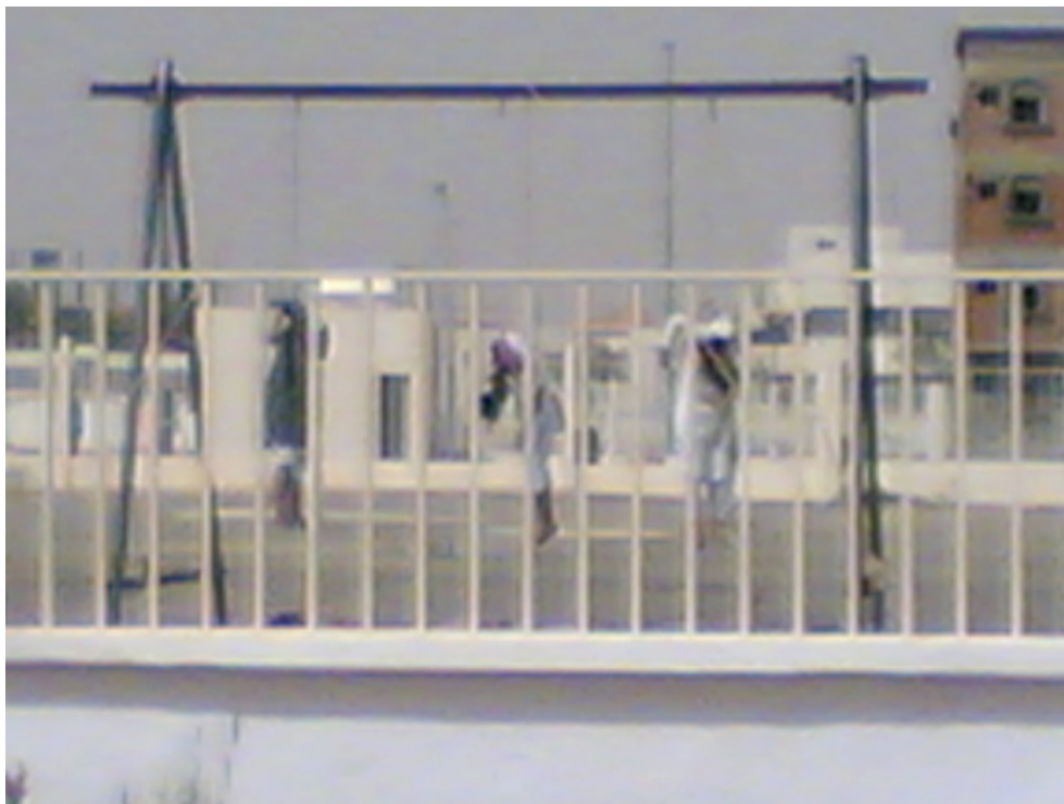
Photo provided by a contact who confirmed that it contains the bodies of three men who were executed and crucified in al-Jouf on 1 April 2005 © Private

In November 2004 the Ministry of the Interior announced that four men arrested in 2003 and accused of political killings in al-Jouf, northern Saudi Arabia, were to be referred for trial. No further information was released until 1 April 2005, when local people awoke to see the bodies of three of the four men on crucifixes after they had been executed. The fourth defendant was sentenced to a term of imprisonment.