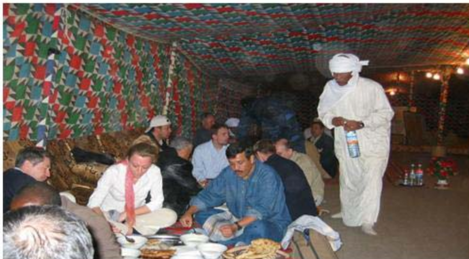
Libyan hospitality : dinner offered at Ghat