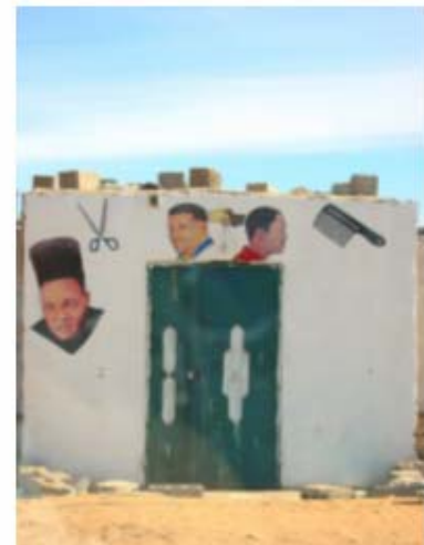
Sub-Saharan shop in Sebha