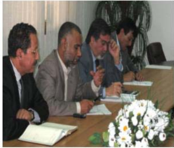
Meeting at Kadhafi Foundation