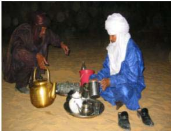
Tea ceremony in Ghat