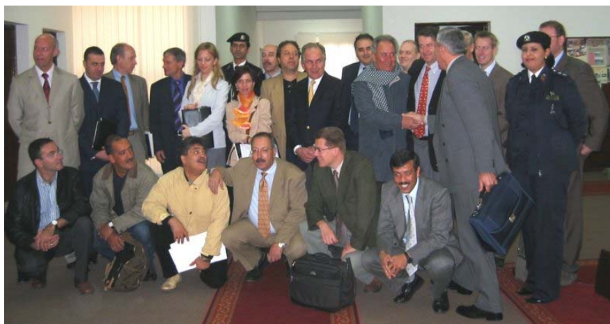
Libyan and European representatives join for a photo opportunity in the course of the mission