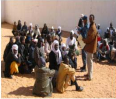
Reception camp in Sebha