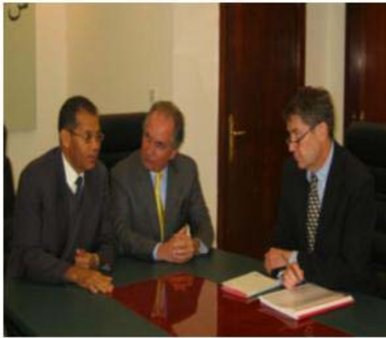
Meeting at the CENSAD