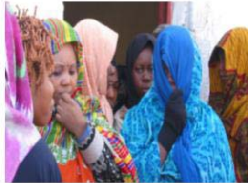
Women are also present as immigrants