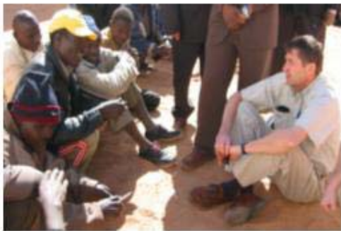
Discussion with immigrants in a camp