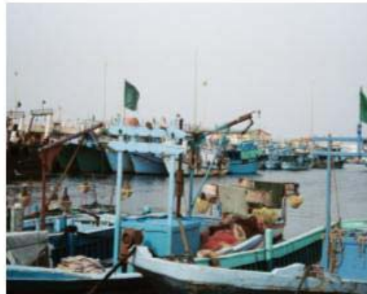
Port of Zuwarah