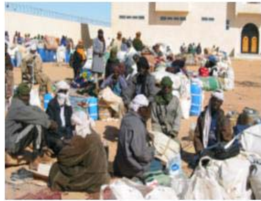
Camp in Sebha with immigrants leaving back to their countries on a voluntary basis