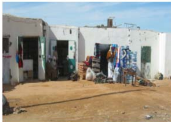
Sub-Saharan neighbourhood in Sebha