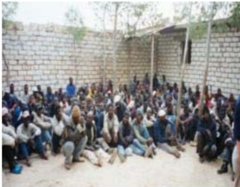
A camp along the northern coast