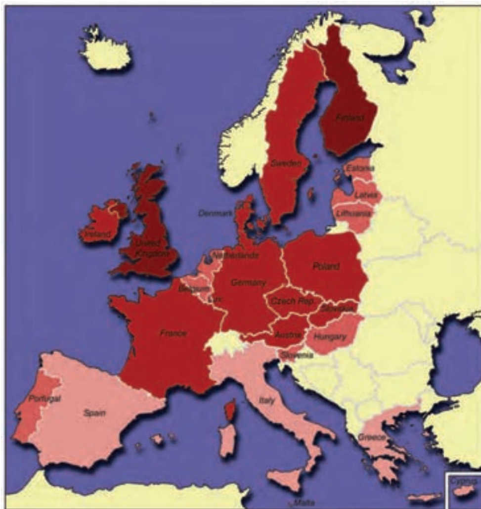
Figure 2: Status of official criminal justice data collection mechanisms on racist crime/violence 2004-2005