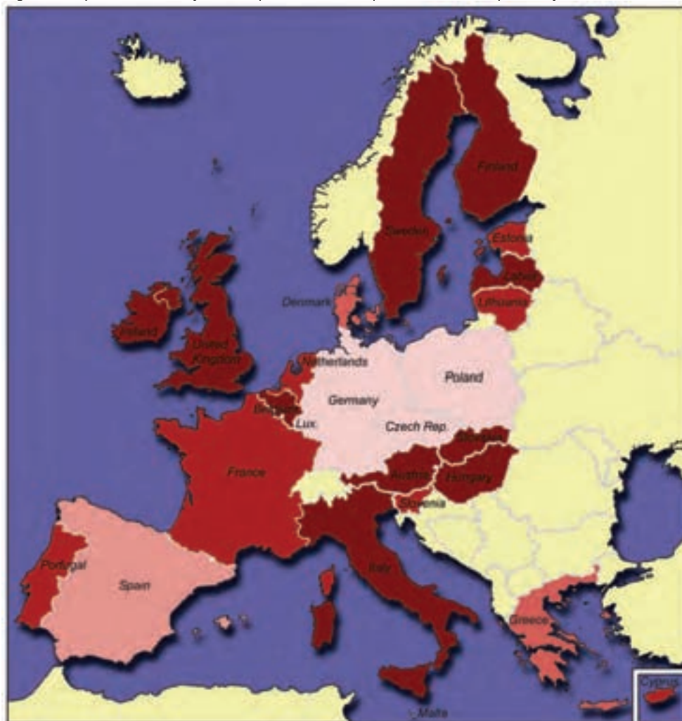
Figure 1: Specialised body for the promotion of equal treatment in place by the end of 2005