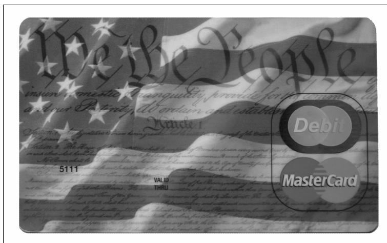
Figure 2: FEMA Debit Card

In the days following hurricane Katrina, FEMA experimented with the use of debit cards to expedite payments of $2,000 to about 11,000 disaster victims at three Texas shelters 10 who, according to FEMA, had difficulties accessing their bank accounts. Figure 2 is an example of a FEMA debit card.